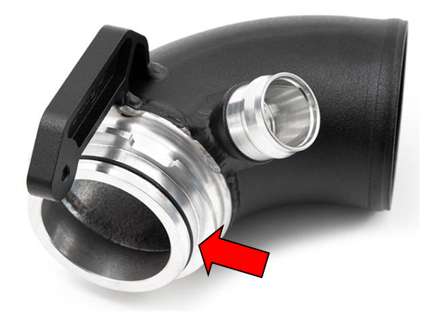
Engineered for performance